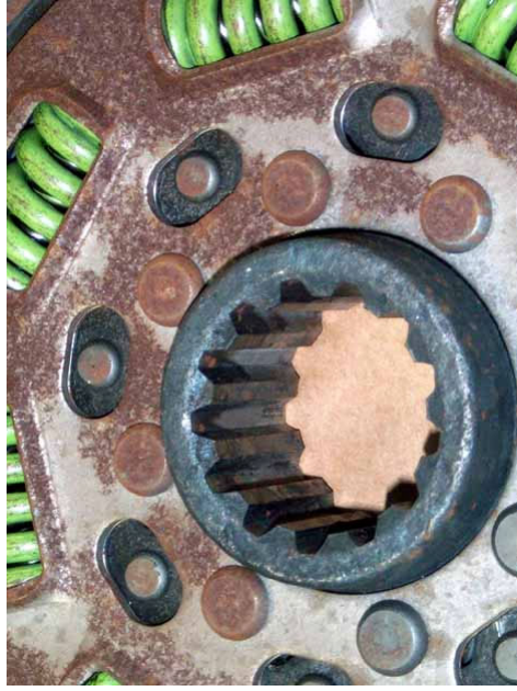
Before / After Rust Removal Comparison