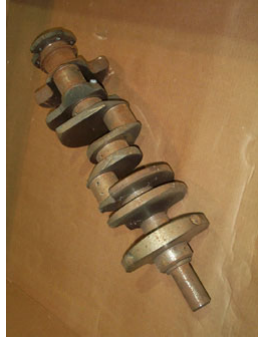
Before /After Rust Removal

After processing Crankshafts were coated with RD - 4000 Dry Film Rust Deterrent; to provide Rust Deterrence